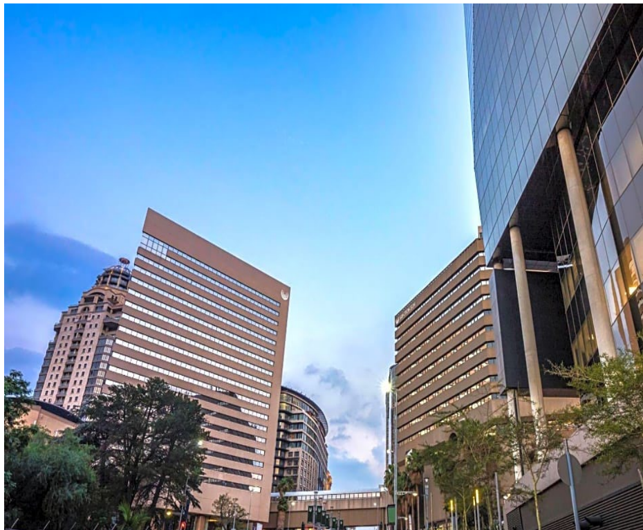
The Sandton Sun and Towers Hotel

Breakfast included in the accommodation package.