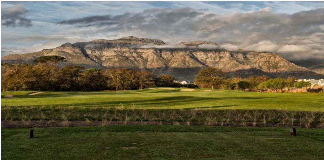
De Zalza beautiful vistas.

Tea, coffee and light snacks will be served before the first tee off time of 12h15