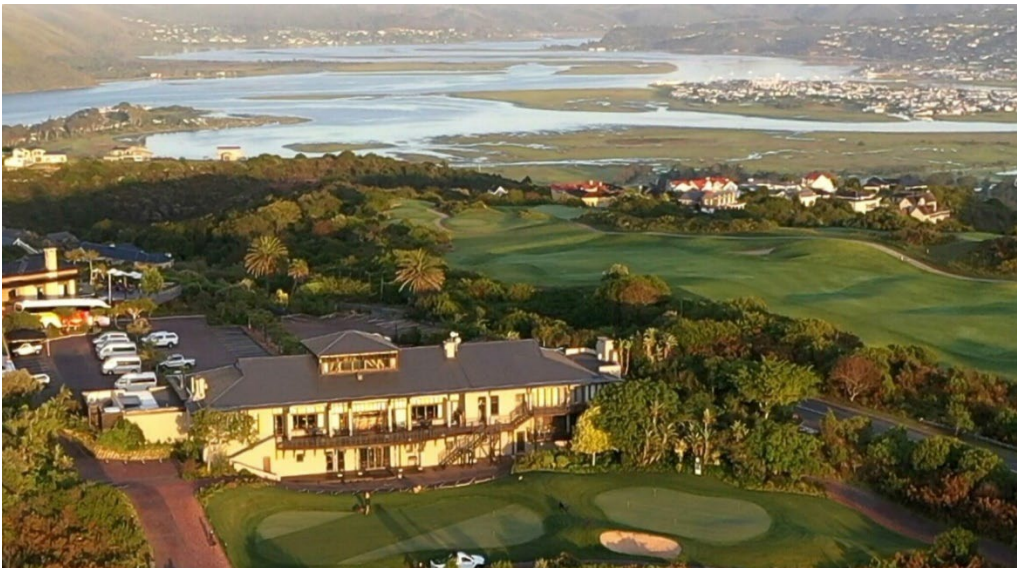
The Pezula Clubhouse and the Knysna Lagoon

Pezula Nature Retreat is located on the Pezula Golf Estate and has spectacular views, great walks, gym, spa indoor and outdoor pools