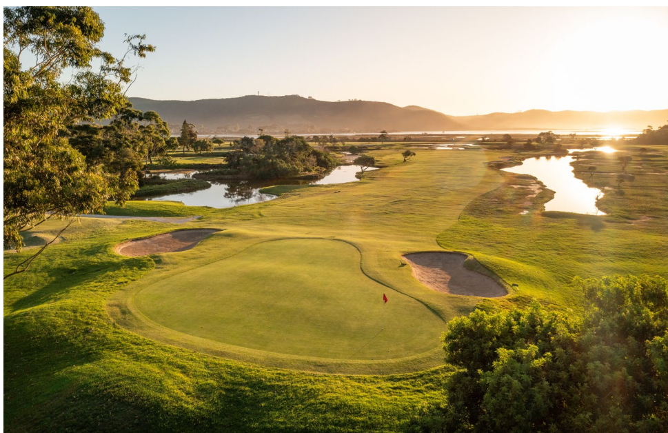
Knysna 6 th hole