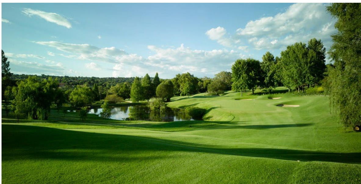
The 4 th Hole The River Club