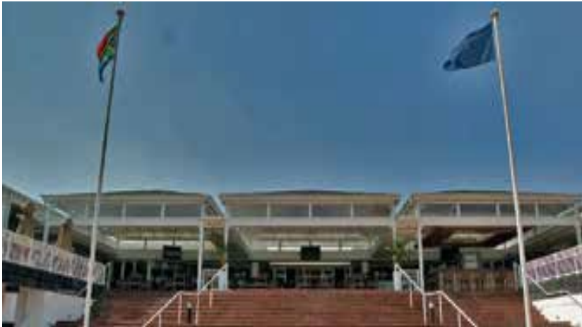
The Johannesburg Country Club Clubhouse