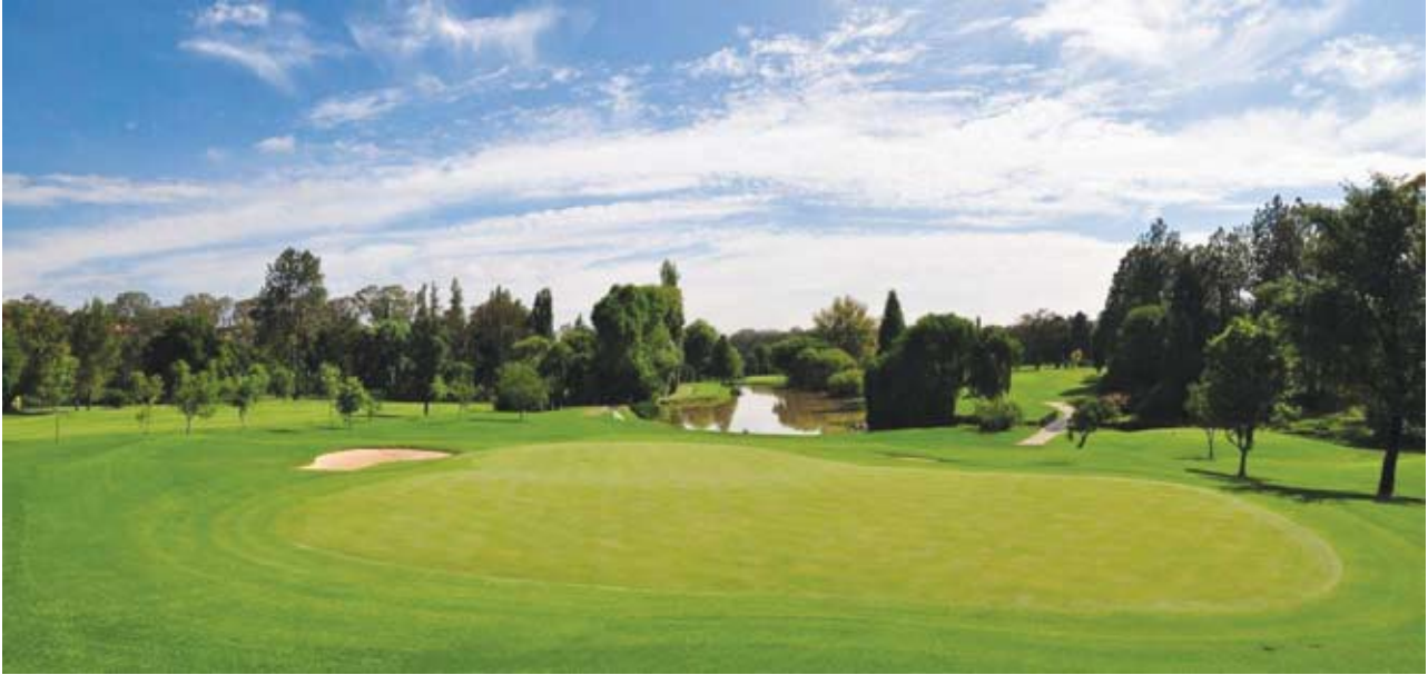
River Club Panorama