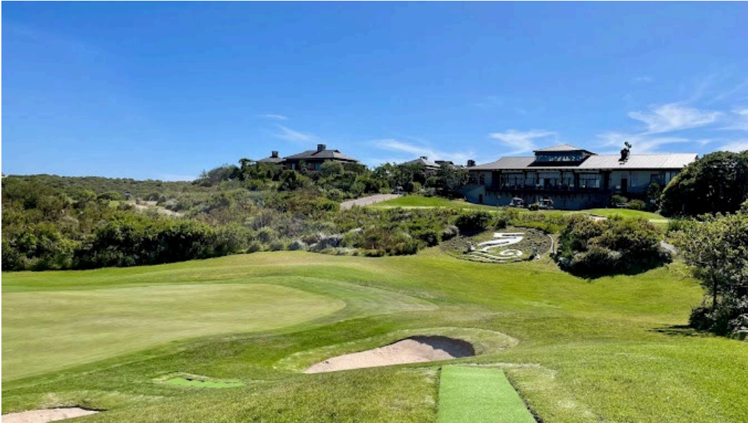
Pezula 18 th Hole and Clubhouse