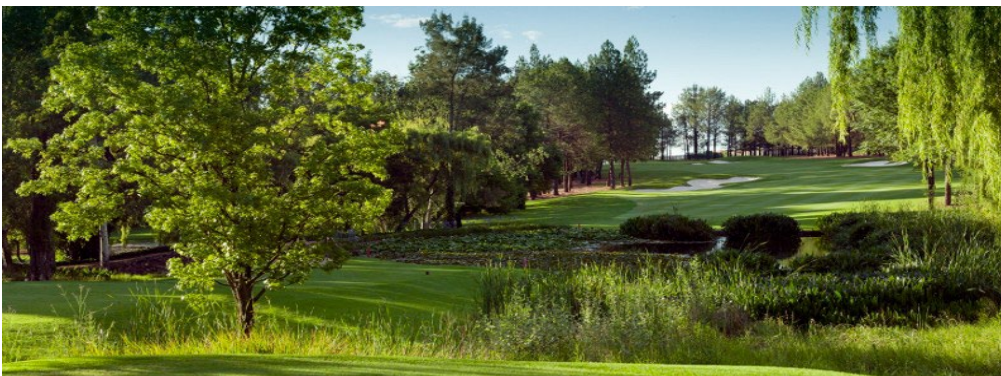
Johannesburg Country Club 4 th Hole