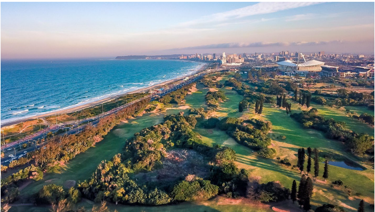
The Durban Country Club

The course recently underwent a very successful rebuild that has resulted in significant modernization and further improvements in quality and layout.