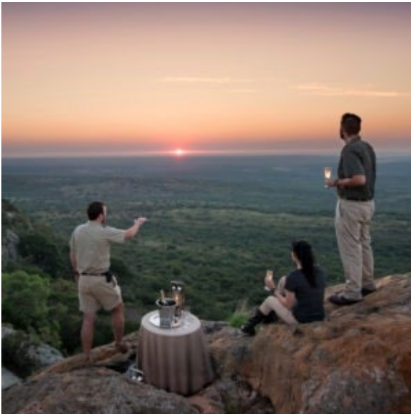
The beautiful Phinda Nature reserve.

You will be accommodated at the Mountain Lodge at Phinda and I urge you to get online at https://www.andbeyond.com and view the wonderful reserve and amenities.