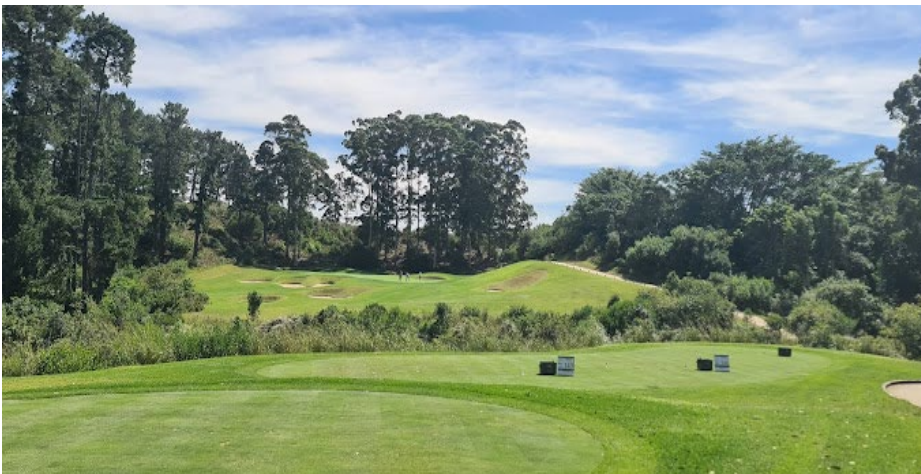
Pezula 5 th Hole