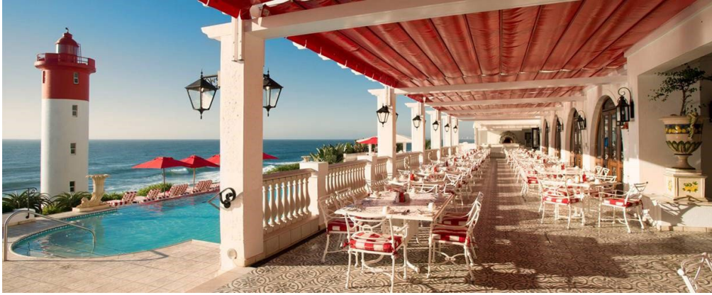
The Oyster Box Hotel

After breakfast you will be transported to the Port Elizabeth airport for your flight to Durban, where you will be greeted by your Kwa Zulu Natal Seniors. You will then be transported by coach to your hotel, the Oyster Box.