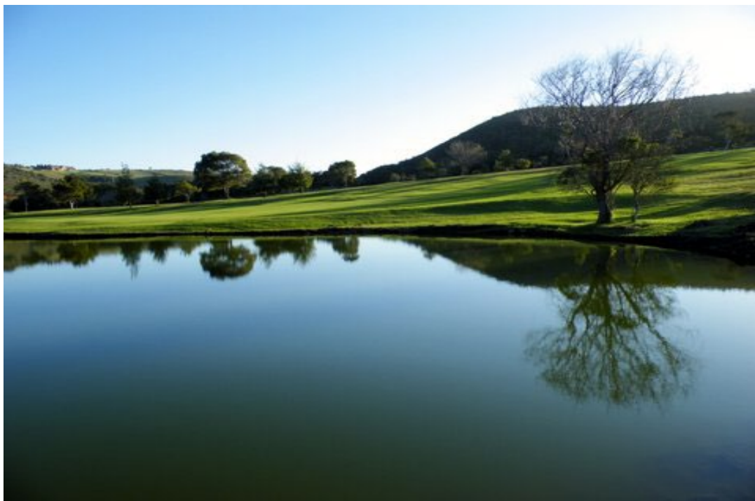
The Beautiful vista of the Plettenberg Bay Golf Club