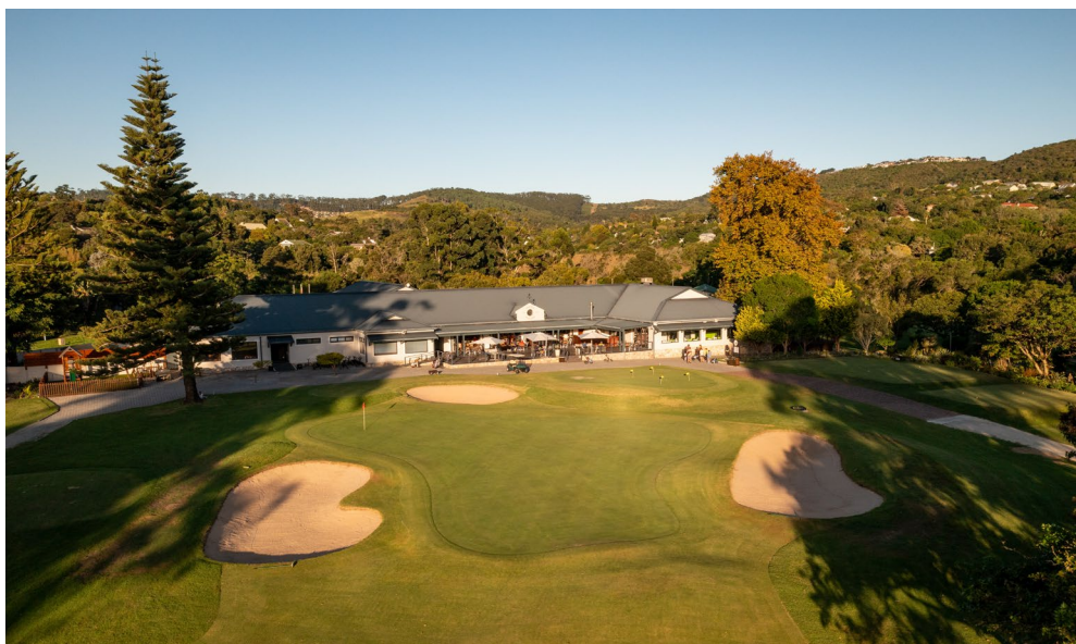
Knysna 18 th hole and Clubhouse

After golf there will be a normal prize giving followed by a free evening to visit the Waterfront and dine at one of the numerous restaurants.