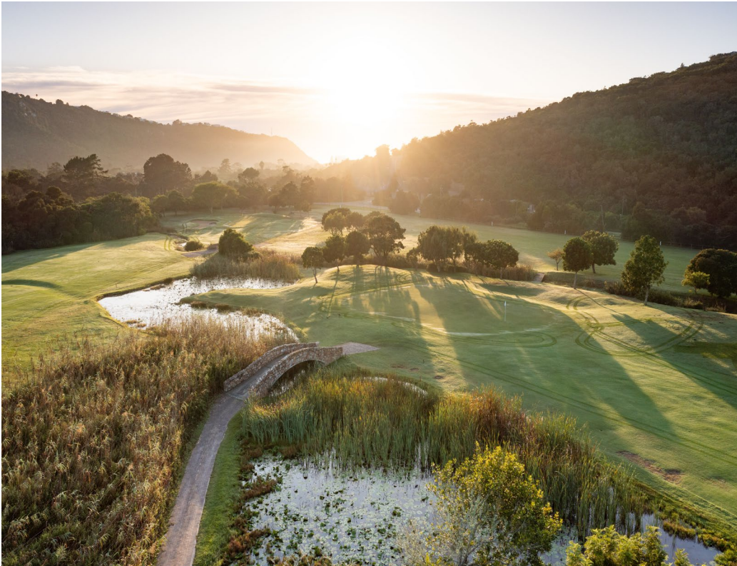
Plettenberg Bay CC Sunrise at holes 2,4 and 5