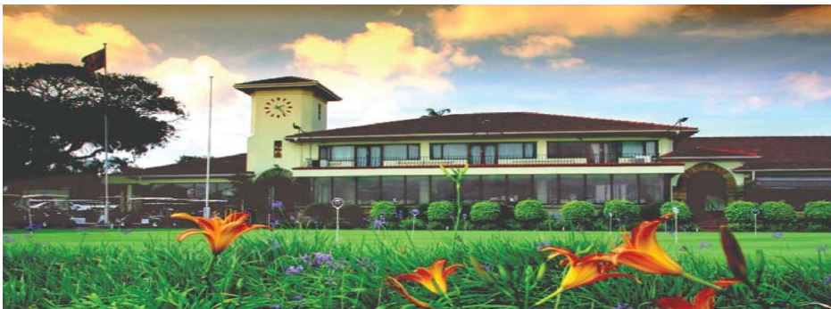
The Royal Durban Clubhouse

You will be transported to the Royal Durban Golf Club for mid-morning tee-off. An oasis of calm amidst a bustling city, Royal Durban Golf Club is conveniently located in the heart of the Greyville race track.