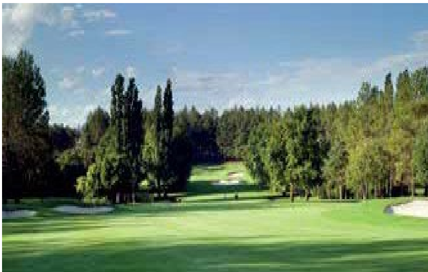
The 2 nd Hole Woodmead Course Johannesburg Country Club