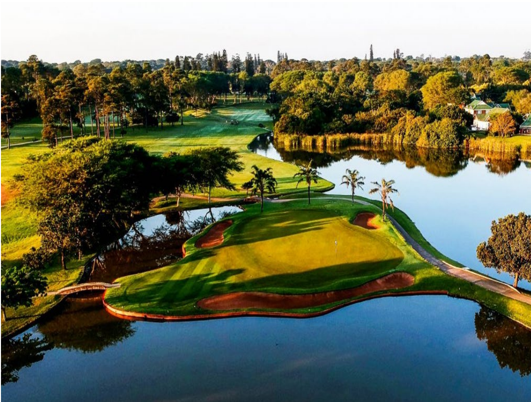
Mount Edgecombe Country Club

The Woods is an extremely attractive, parkland golf course that includes many exotic trees and attractive lakes and ponds. Originally designed by Sid Brews and established in 1936, this championship course was subsequently modernized and most recently underwent an extremely successful upgrade in 2023.