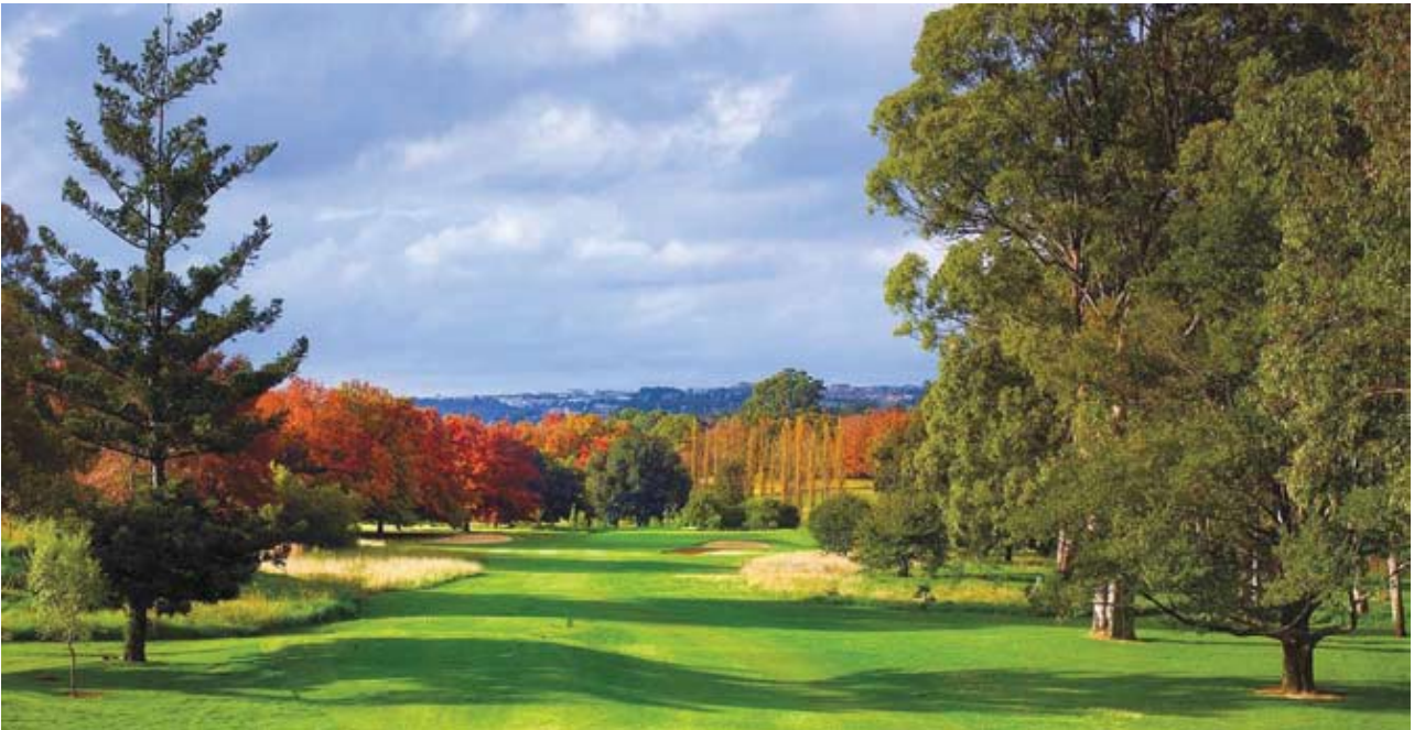
The 2 nd Hole Royal Johannesburg East course

Breakfast at leisure. Coach departs hotel for Royal Johannesburg at approximately 10h00 for your official game against the Gauteng Seniors. Light snacks will be served before teeing off.